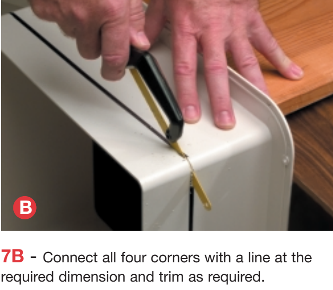
required dimension and trim as required.