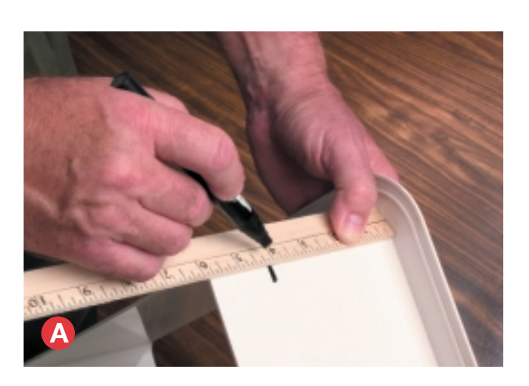
7A - After adding 1/2 inch more, a line is drawn on the outside of the Garnish Ring at 4 inches.

In the picture shown to the left, the installation measured 3 and 1/2 inches from the ceiling to the Control Plate.