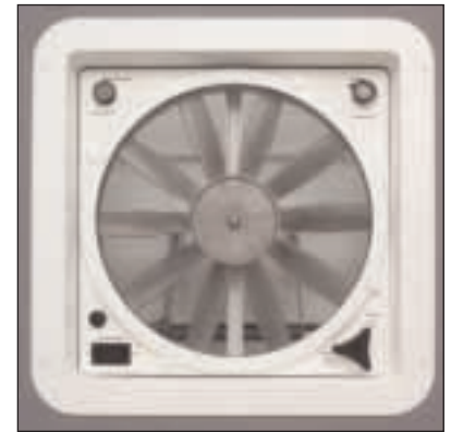
Interior of MaxxFan™

3 The MaxxFan™ securely fastens to the roof flange using four stainless steel screws that are provided. Installing the interior trim ring at the ceiling completes the installation. Complete detailed instructions are included inside each MaxxFan™ package and are available at the MaxxAir Vent Corp. website.